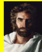
Incarnation of Jesus