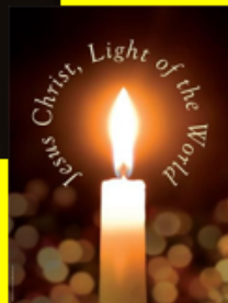
Word Made Flesh